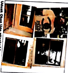
Udiak Ono Udo attacked for attempting to help Uryime who ran to his compound for help