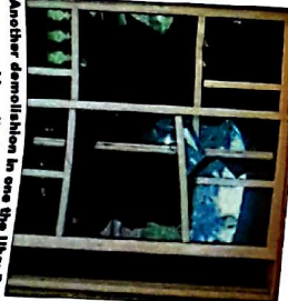
Another demolition in one of the Udemere's compound in exile (3)