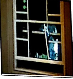
Attack on Imo Ehim Frank's compound after he returned from the trip to Abuja to protest the carnage in the community 1