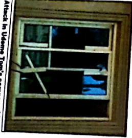
Attack in Udemere Tom's compound by sponsored gang