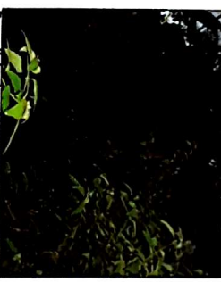
Demolished and deserted home of Uto Imoh currently in exile