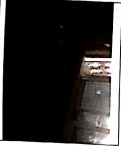
Another demolition in one of the victims compound in exile (2)