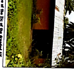
Home of the 2IC of the dreaded AK members gang