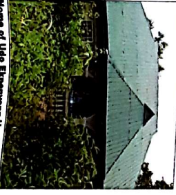
Home of Uto Ekeonyong Uwa murdered and burnt by AK Marine in broad day light