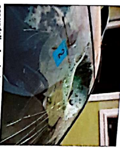
car vandalized and windshield smashed by the sponsored gang