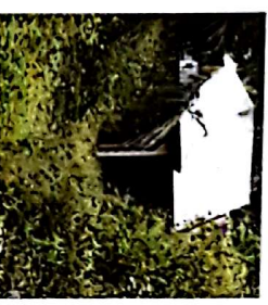
Deserted home of Udemo Alpan in exile