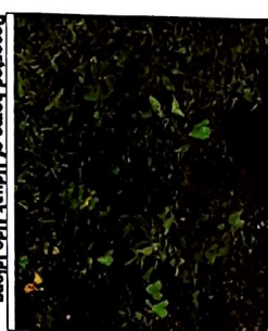
Deserted home of Uduak Udo Idiong currently in Exile