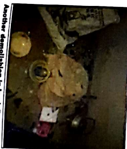
Another demolition in Imoh Frank's compound, Victim in exile