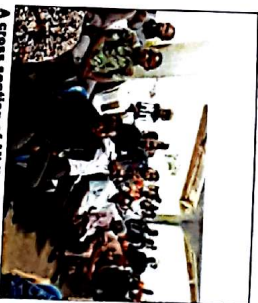
A cross section of Midim community members during an amnesty initiative by Victor Udom in the presence of state security and press team 9th Sept.