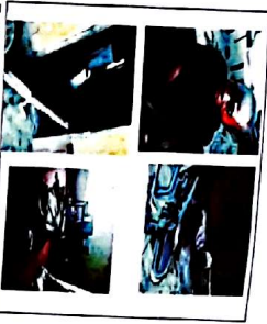
Emam Udom after a warning attack by the gang 21c