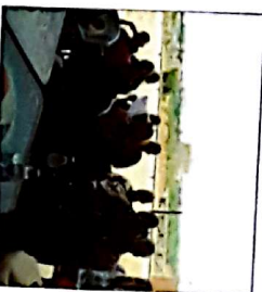
A cross section of victims who visited Abjula to protest the unfolding carnage to the 1c monitoring team in charge of the investigation 2