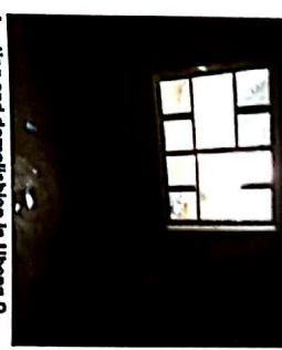
Looting and demolition in Uboang O. Udo's compound as the victim successfully escaped being killed