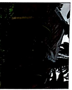
Deserted home of Uboang Udo now in Exile

Many other deceased victims (Aniekan Friday) pictures not available