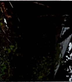
Deserted home of Ehimbut Friday who narrowly escaped assassination. In exile till date