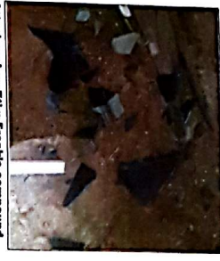
Attack on Imo Ehim Frank's compound after he returned from the trip to Abuja to protest the carnage in the community 2