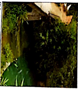
Miklan Ibor Alpan Bridge Linking Eastern Udim LGA and Ehim Ekpo LGA in Akwa Ibom State