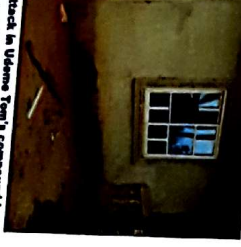
Attack in Udemere Tom's compound by sponsored gang (2)