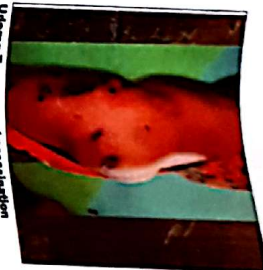
Udemere Tom second assassination attempt in the last 3 months