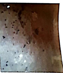
Looting and demolition in Uboang O. Udo's compound as the victim successfully escaped being killed