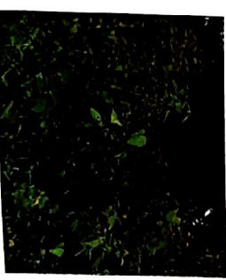
Deserted home of Uduak Udo Idiong currently in Exile