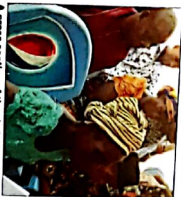
A cross section of the victims who came from various hide out across the country to Abjula to express their frustration in the way the investigation